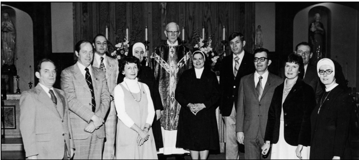
EXTRAORDINARY MINISTERS OF COMMUNION INITIATED IN OUR PARISH

Each year, new extraordinary ministers are invited by the pastor to serve for a five-year term. And we still come to Mass hungry for the Body of Christ.